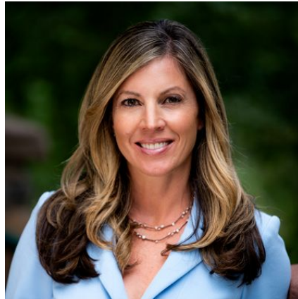
Senator Siah Correa Hemphill