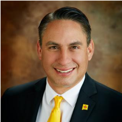
Lieutenant Governor Howie Morales